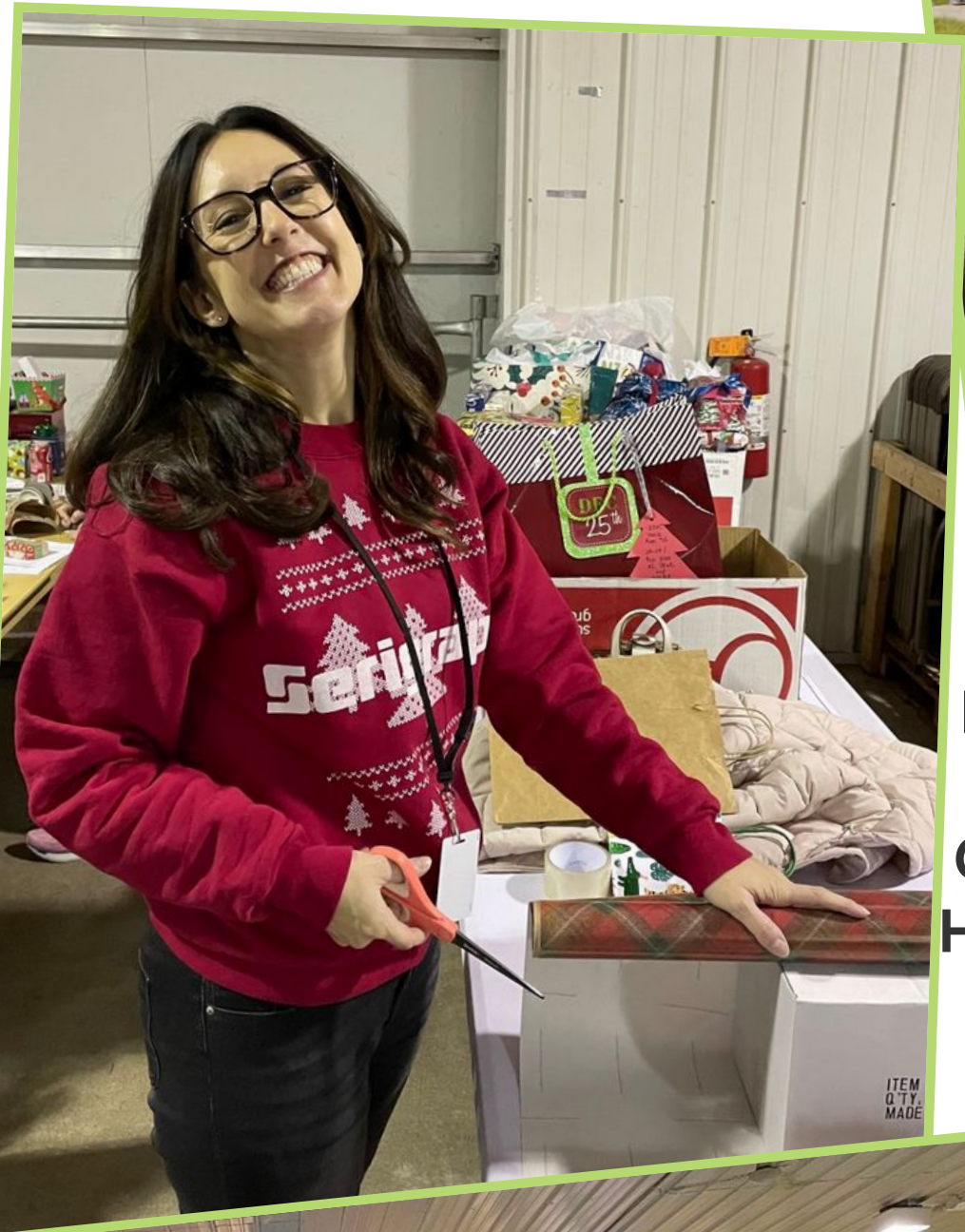
Wrap Christmas Presents for local Gingerbread House Charity