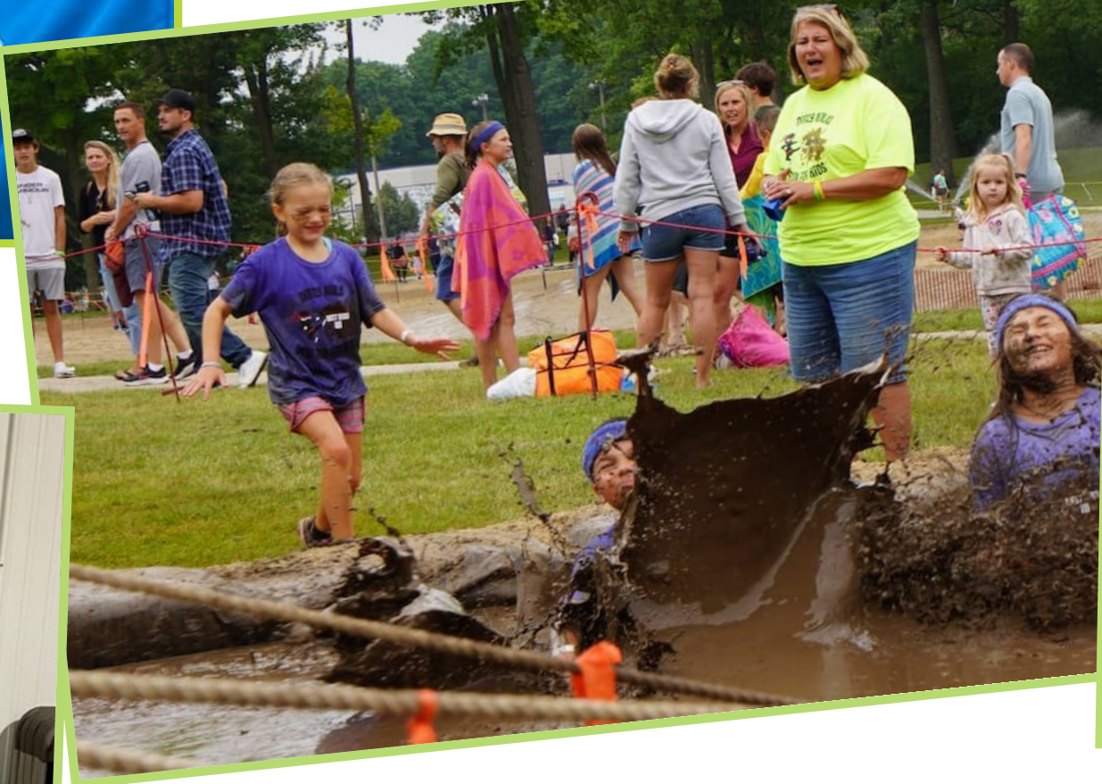
Sponsorship of West Bend Kids Ninja Mud Run