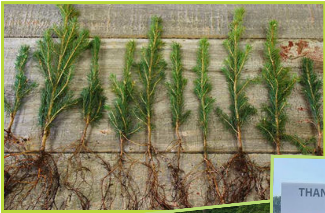
500 sapplings given to all of our employees to support Arbor Day Foundation