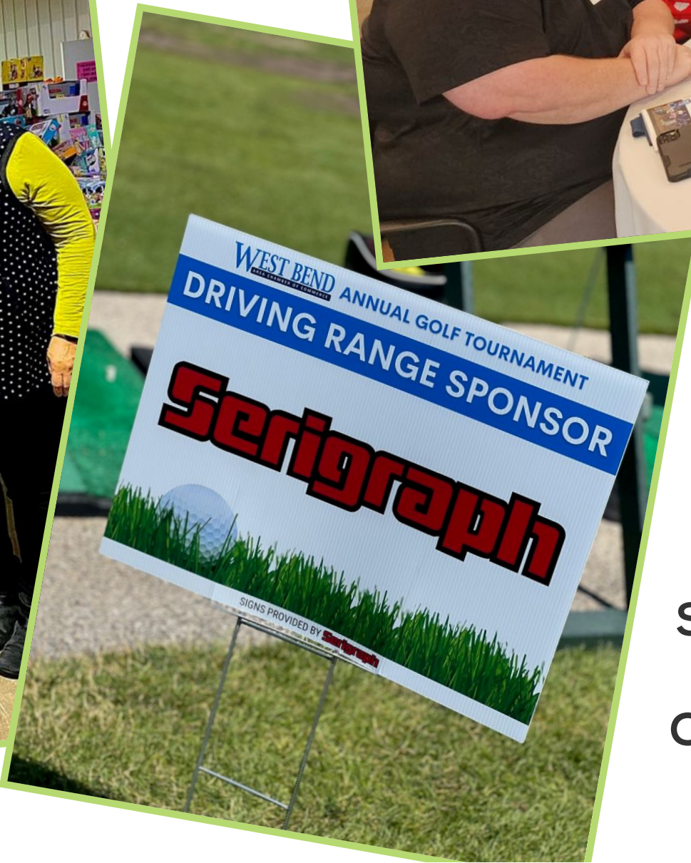
Sponsorship for West Bend Chamber of Commerce Golf Outing