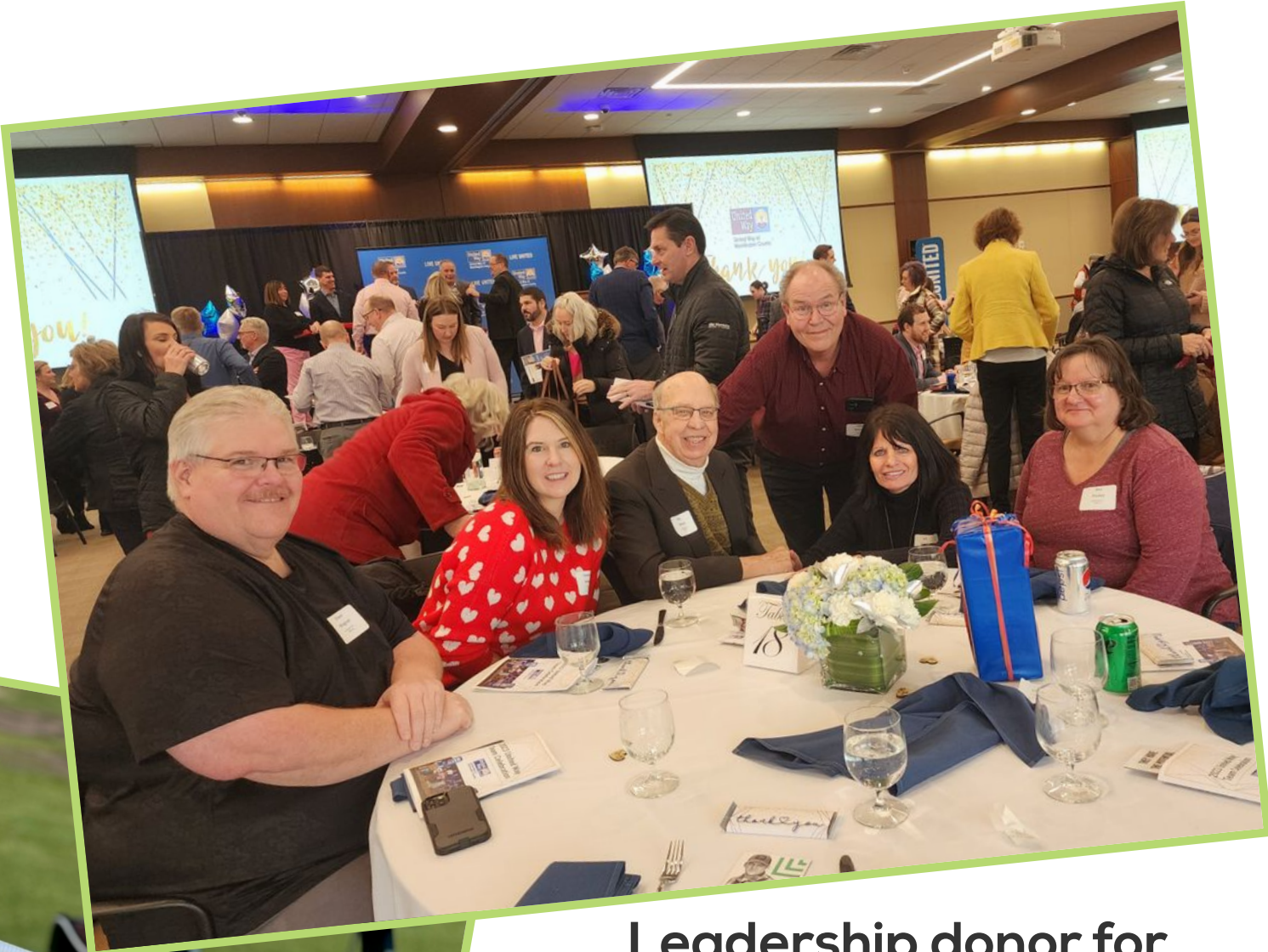
Leadership donor for United Way of Washington County